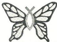
"The Christian Butterfly"®

In the spring of 1986, I had just pulled into my driveway when I felt God speak into my mind. I can only describe the voice as a strong thought which I recognized immediately as not my own. It said, "I want you to create a sculpture of Jesus washing Peter's feet." I was so startled by the thought that before I could think about it I said, "But God, what about all the things I'm doing?" Even though this thought kept coming back over and over, I put God on hold, still not having learned to immediately obey His voice. At the time, I could see no way this sculpture could help my critical financial, medical, or marital problems.