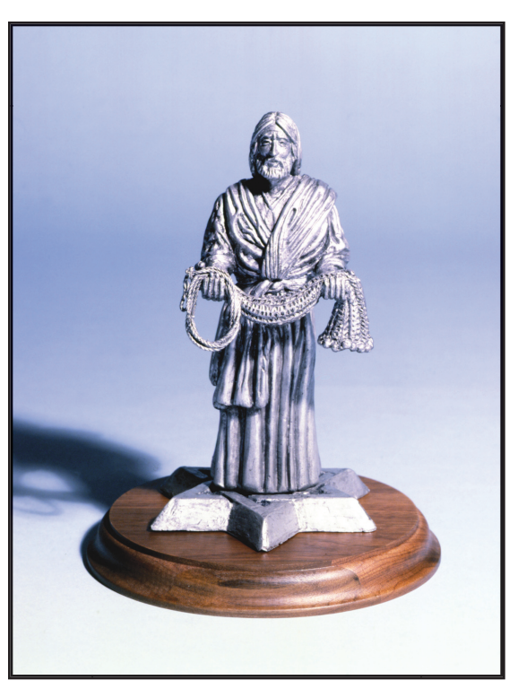
"Fisher Of Men"® 1/12 Life size Pewter Sculpture Mounted on a walnut base 6" x 6" x 7" (3 lbs.) #00846 $220