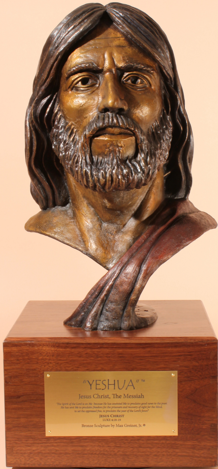
"YESHUA"™ Jesus Christ, the Messiah of the Jews