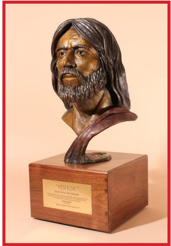
The face of Christ Max created for "YESHUA"™ is the same one given to him by the Holy Spirit in 1990. It was used on "Divine Servant"®, "Fisher of Men"® and "The Coming King"®.