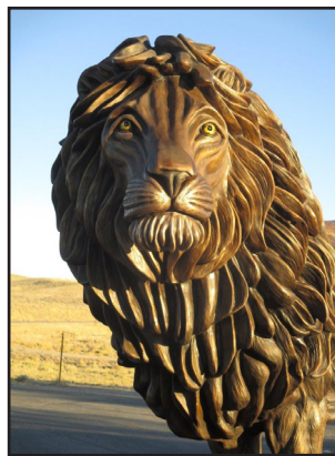
The first life-size "LION OF JUDAH" Bronze Sculpture was cast by Eagle Bronze on 8/16/17.